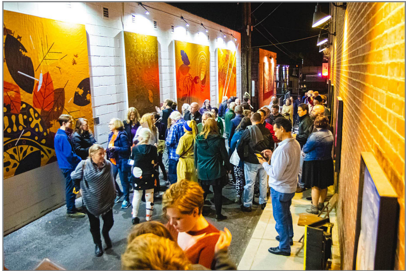
Spectators gather at the unveiling of the latest works for the Art In Public Places Program, four Charley Harper Murals, on October 25, 2019.

ART26201 held the 2019 Young Filmmaker's Camp in June, which saw the fourth year of training 16 young Buckhannon filmmakers.