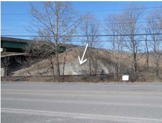
Northeast view from Main Street